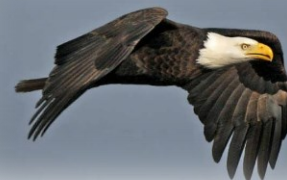
Remember, "flyovers" count in the GBBC.