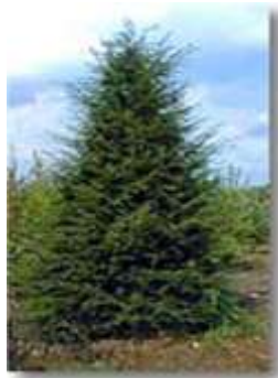
Pennsylvania State Tree – Eastern Hemlock Tsuga canadensis