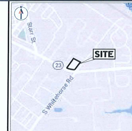
LOCATION MAP SCALE: 1"=1,000'